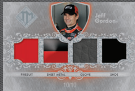
JEFF GORDON TOTAL MEMORABILIA QUAD CARD