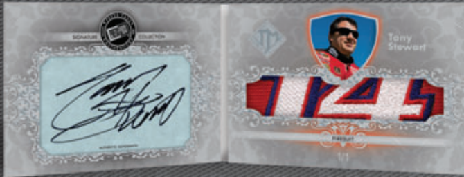
TONY STEWART AUTOGRAPHED PATCH BOOK CARD