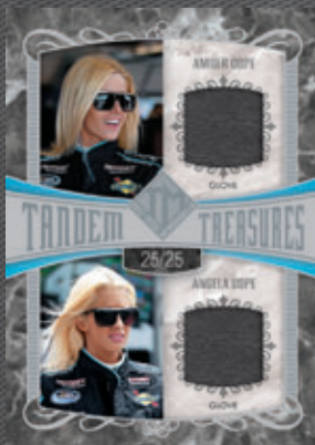
COPE TWINS TANDEM TREASURES DUAL MEMORABILIA CARD